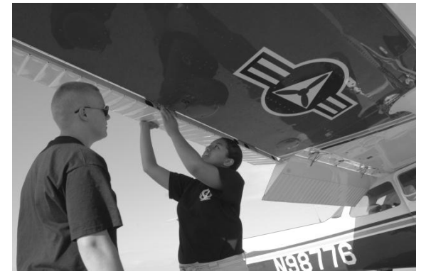
Cadet learning to fly at the C.A.P. National Flight Academy