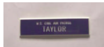
New U.S. CIVIL AIR PATROL nametags for the corporate service uniform.

Silver sleeve braid: worn only by senior member officers. 1/2" wide for grades of FO through Colonel. Brig Gen and Maj Gen (only) wear 1-1/2" wide silver sleeve braid. Braid is worn 3" from the end of the finished sleeve length and all around the sleeve.