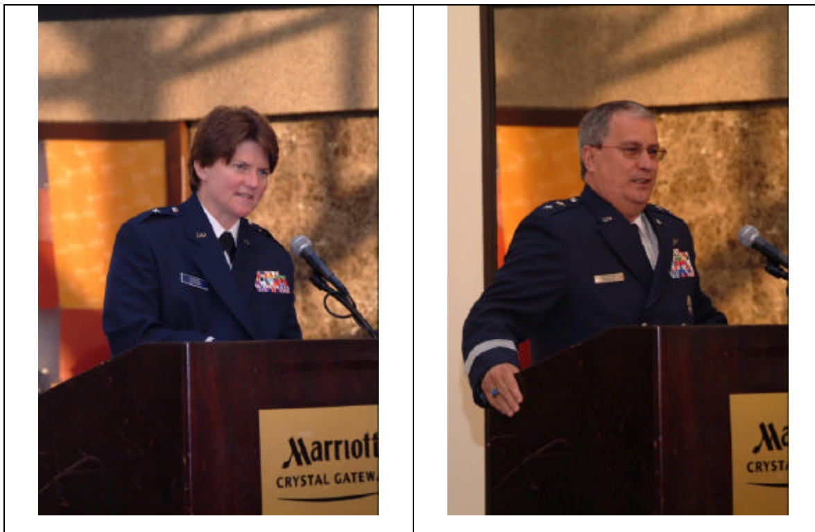
Brigadier General Amy Coulter, CAP National Vice Commander and Maj Gen Antonio Pineda, CAP National Commander both wear the CAP corporate uniform jacket at the annual CAP Legislative Day in Washington D.C. Notice that General Coulter is wearing the female version of the jacket, though she is incorrectly wearing the blue plastic two line nametag and narrow silver braid for the officer grades of colonel and below. General Pineda is wearing the correct nametag and braid – notice the difference. The lay of the female overblouse tab varies in appearance depending on where it is placed under the collar.

White shirt (aviator style) must be worn with the AF blue herringbone tie or overblouse tab when the service jacket is worn. A black bow tie may be worn for more formal occasions in the same way as the semi-formal uniform; remember to remove the nametag if doing so.