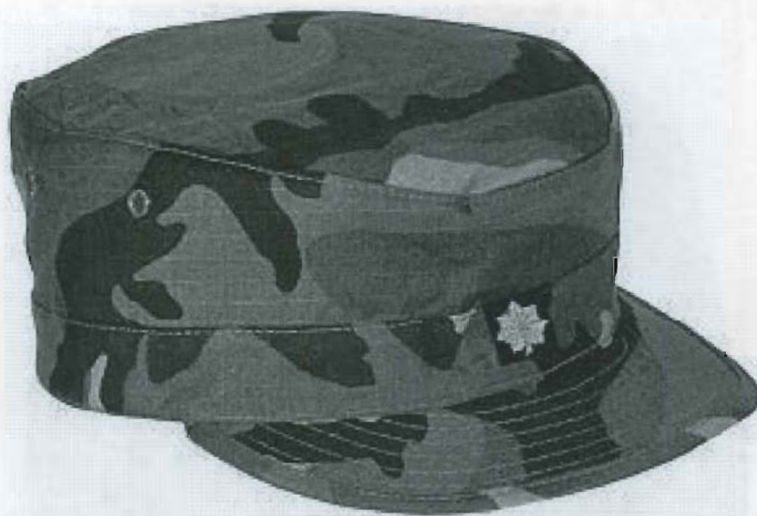
BDU Cap with Grade Insignia Worn by Senior Member Officers (Worn centered ½ inch above the brim)