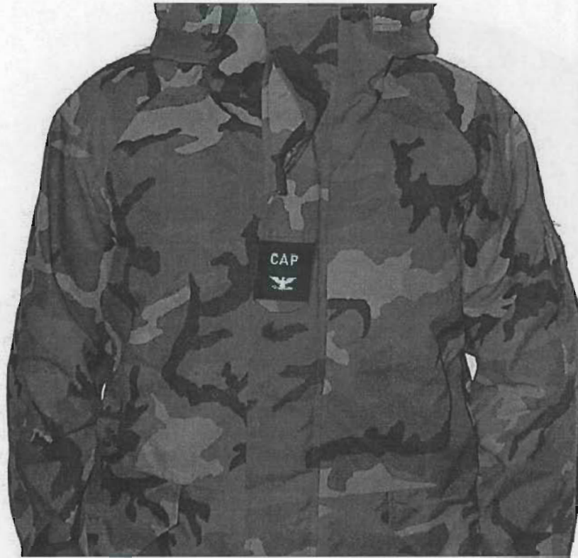
Gortex Parka with CAP Distinctive Device (Cadet and senior member NCO wear device with embroidered CAP but metal grade)