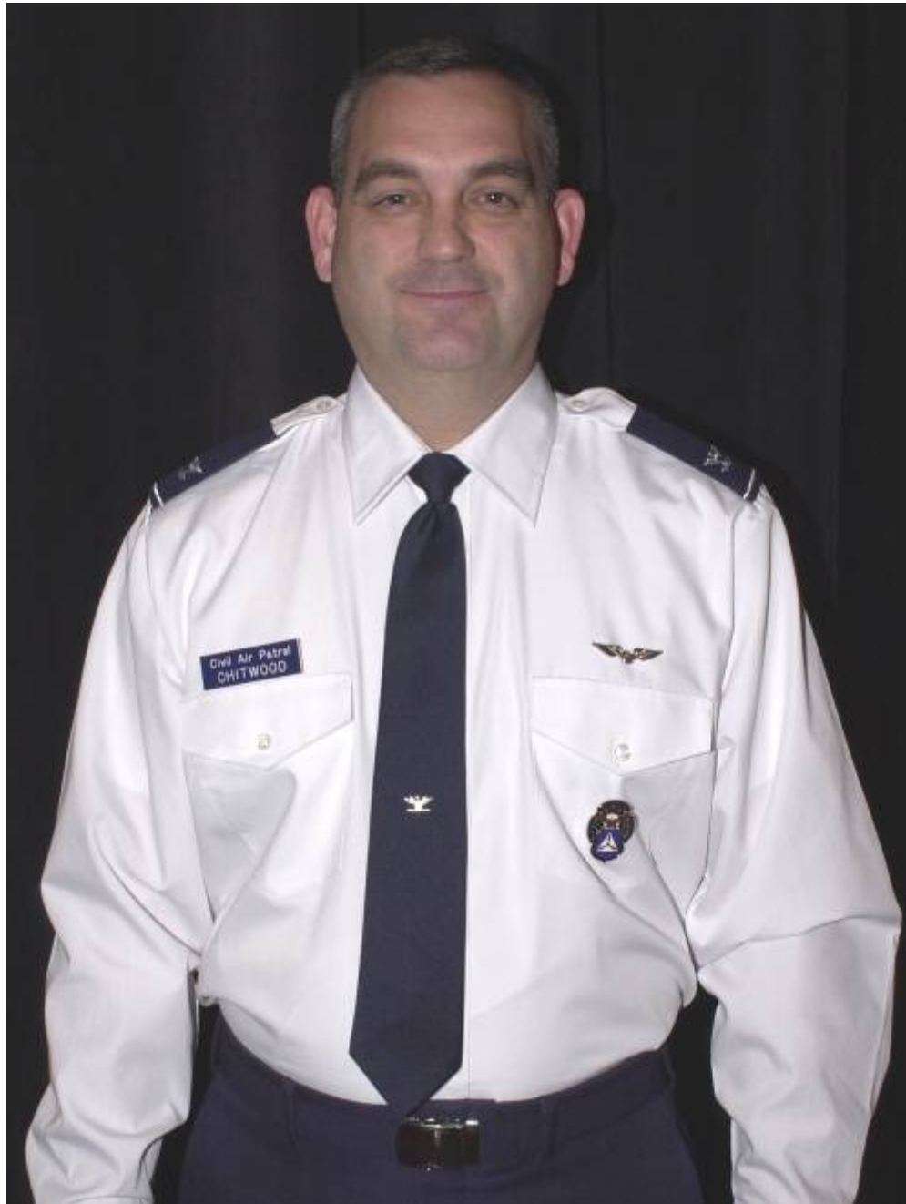
New CAP Distinctive Uniform