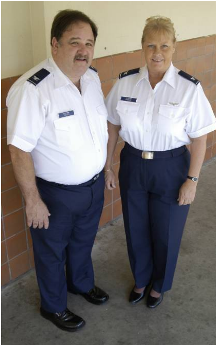
New CAP Distinctive Uniform