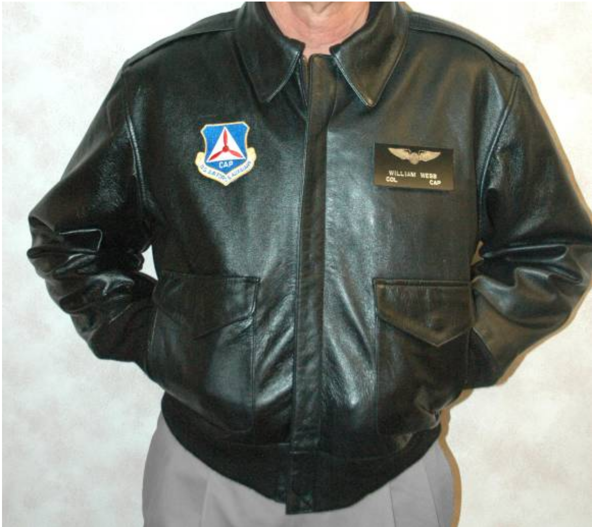
CAP Black Leather Jacket